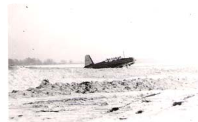
February 1947

Also pictured is a Vultee taking off on the main runway, which today is called taxiway Delta.