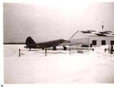
March 5, 1939

A Pennsylvania Central Airlines Boeing 247D is shown below just arriving at Muskegon County Airport. The checkered hangar in the background was originally located at Continental Field, on Getty Street. It was relocated to Muskegon Airport in about 1930. It was most recently occupied by the U.S. Coast Guard until Fall of 2005.